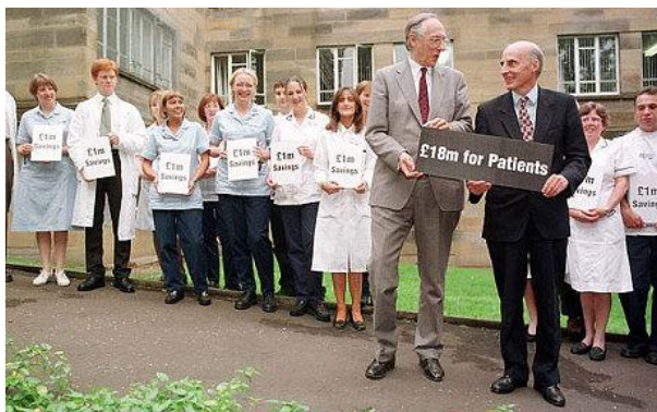
Scottish Secretary of State Donald Dewar and Health Minister Sam Galbraith in 1998

As a consultant, Galbraith was renowned for his altruism and lack of ego. He spurned private practice, and on receiving a sizeable pay increase in 1983 donated 10 per cent of it to the NHS. As head of Scottish Medical Aid to Nicaragua he raised £60,000 for a health centre there; he also found time to serve on the General Medical Council and the executive of the technological union ASTMS, and act as president of the Medical Practitioners' Union.